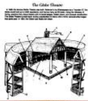
Shakespeare's Globe Theatre