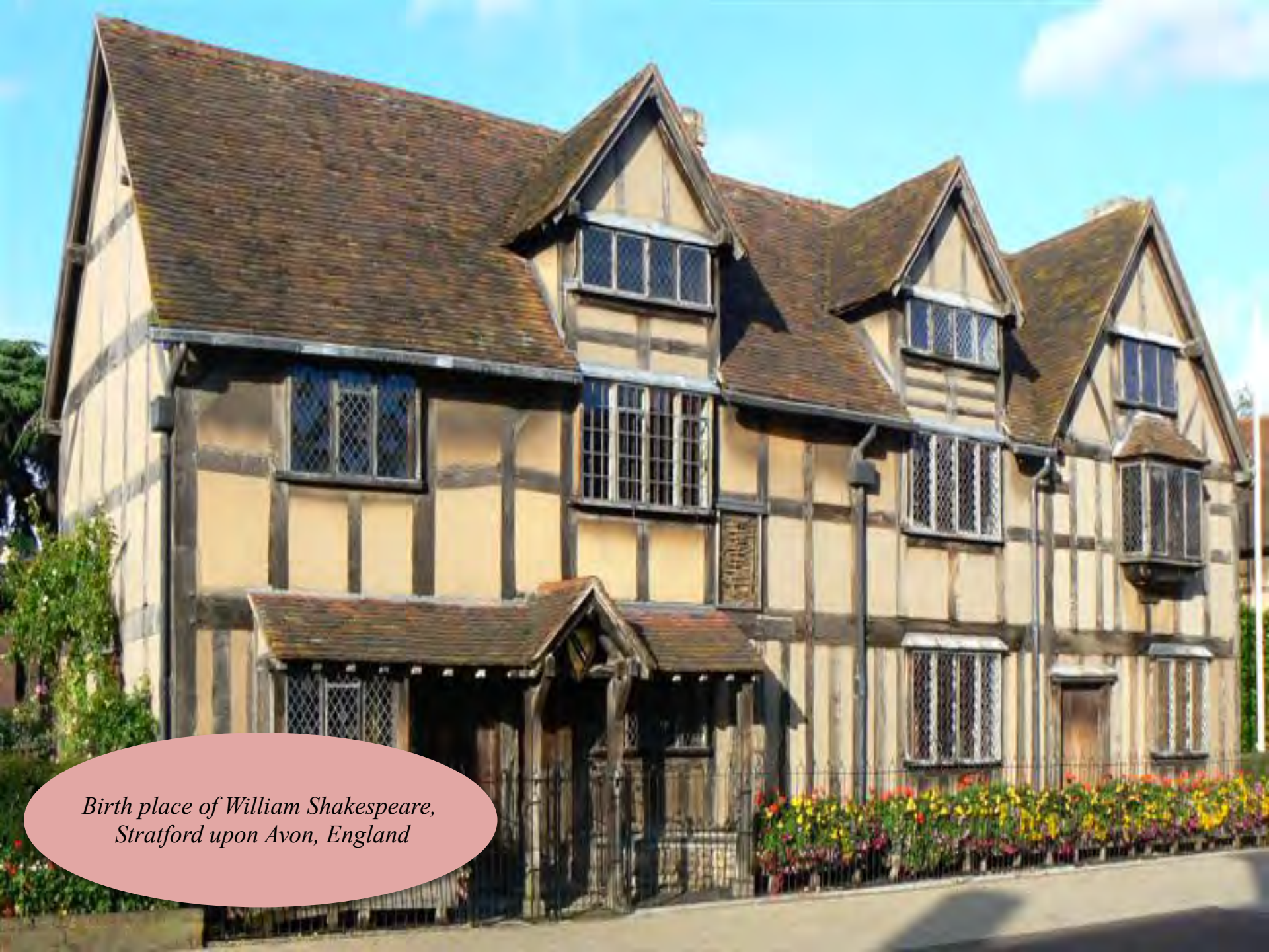
Birth place of William Shakespeare, Stratford upon Avon, England