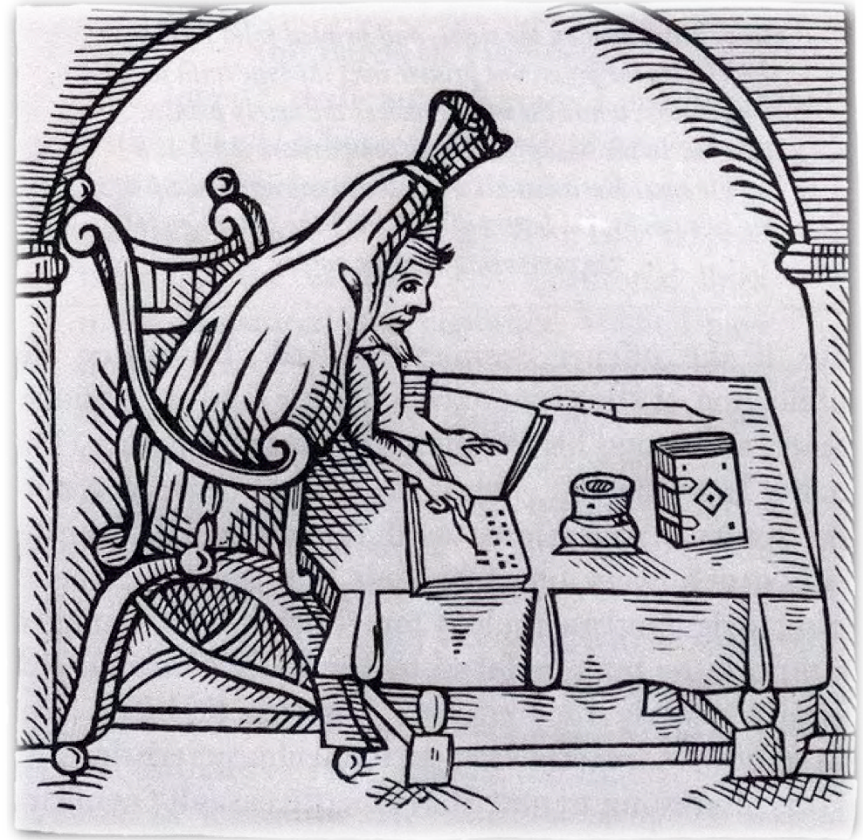
An etching made of Robert Greene after his death